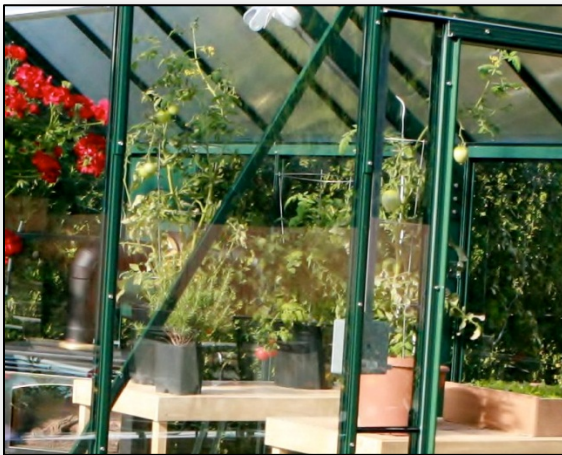
Close up of greenhouse without pressure cap showing exposed hardware

Greenhouses that incorporate the decorative pressure cap are upgraded to single; one-piece 6mm tempered safety glass to ensure the pressure cap is a seamless fit. This single sheet of glass provides a substantial and streamlined design.