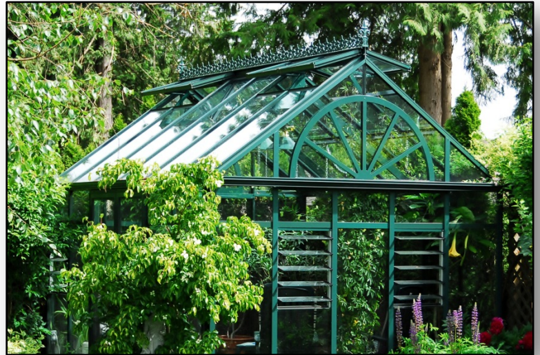
Greenhouse with decorative frame cover

What is a decorative pressure cap? It is a wider profile aluminum beauty cover that gives the look of a more substantial structure (glazing bar) without the cost. Our standard hobby glazing bars have exposed screws and hardware where the decorative pressure cap (also called beauty cap) creates a high style, clean finish that is very popular with homeowners who would like a garden conservatory in their yard and prefer a more finished trim.